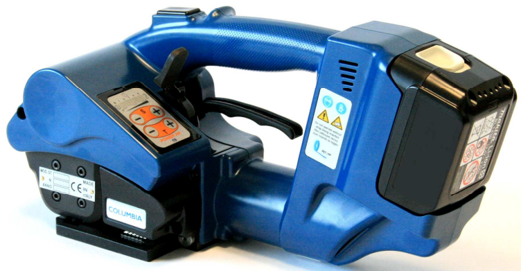
Manufactured by the M.J. Maillis Group